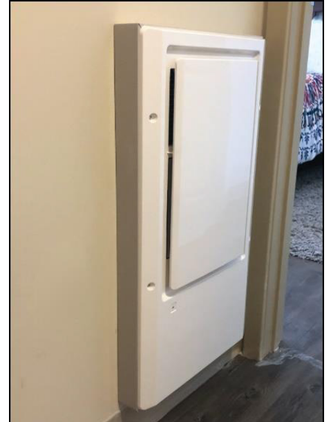
IW25-5 In Wall Dehumidifier installed with Exterior Sleeve and cover.