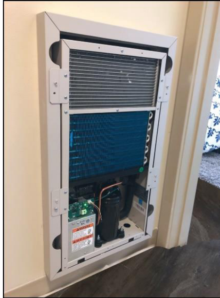
IW25-5 In Wall unit with mounting brackets attached to Exterior Sleeve