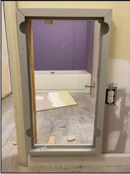
Exterior sleeve mounted against wall and firmly secured into a solid surface. (ie timber stud)

Exterior Sleeve Dimensions: 445mm W x 775mm H x 56mm D